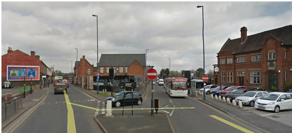
Fig 10 - View 4: existing key gateway view from the site and Pershore Road

Two storey traditionally built residential dwellings are to the site's eastern perimeter. To the north of the land, adjacent to the British Oak public house is vacant land that is proposed for further residential use to be developed by SevenCapital.