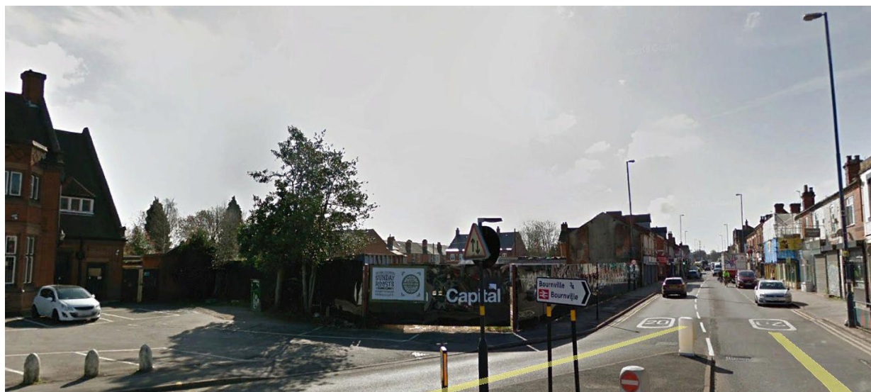
Fig 11 - View 5: existing key gateway view from the Pershore Road junction to site