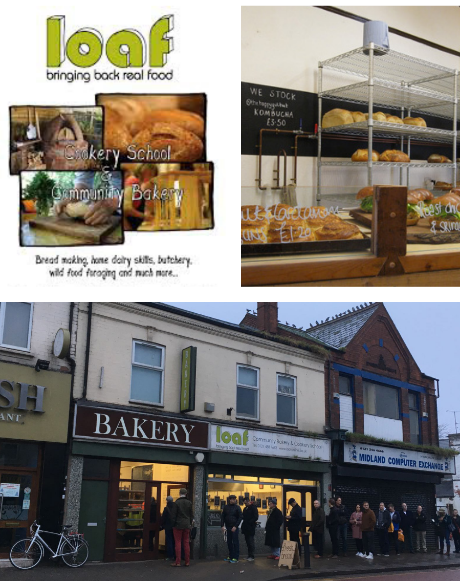
Fig 3 - Existing Loaf Bakery Shop on Pershore Road

Loaf have reached the capacity limits of their current premises. Moving to larger premises with a secure future would enable Loaf to develop this work further, training and employing more bakers and expanding their reach in the locality and beyond.