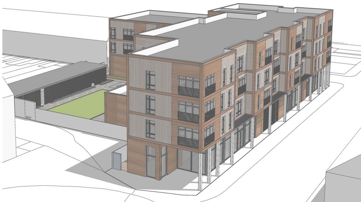
Indicative massing of proposals along Pershore Road