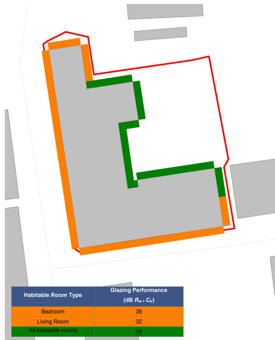
Fig 13 - Proposed Facade sound insulation area and glazing performance

Further detail can be found in the Air Quality Assesment.