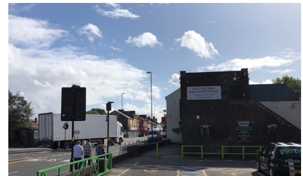
Fig 9 - View 3: existing retail unit building at the junction