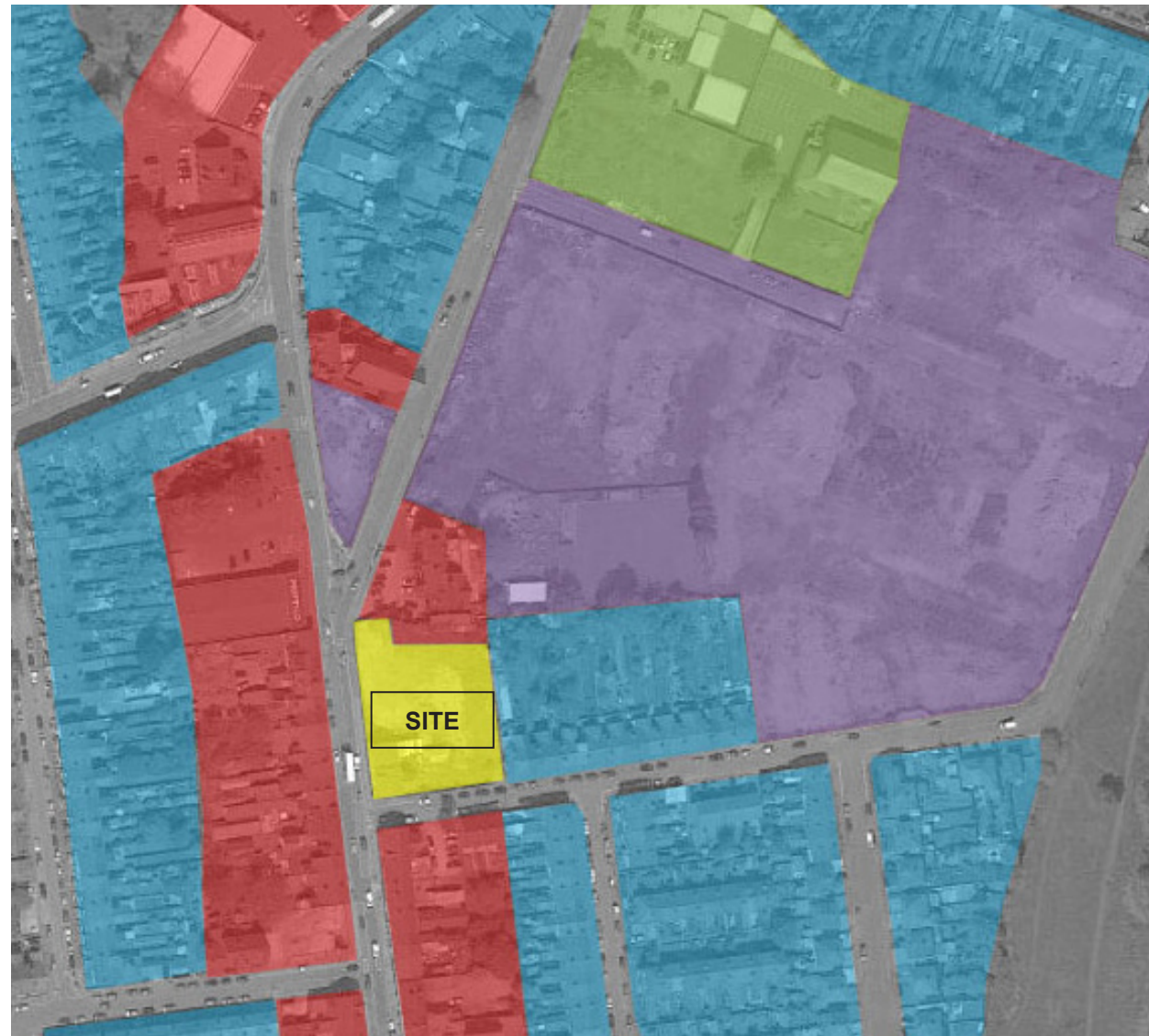
Fig 6 - Site Context Map

Green coloured areas indicate commercial buildings.