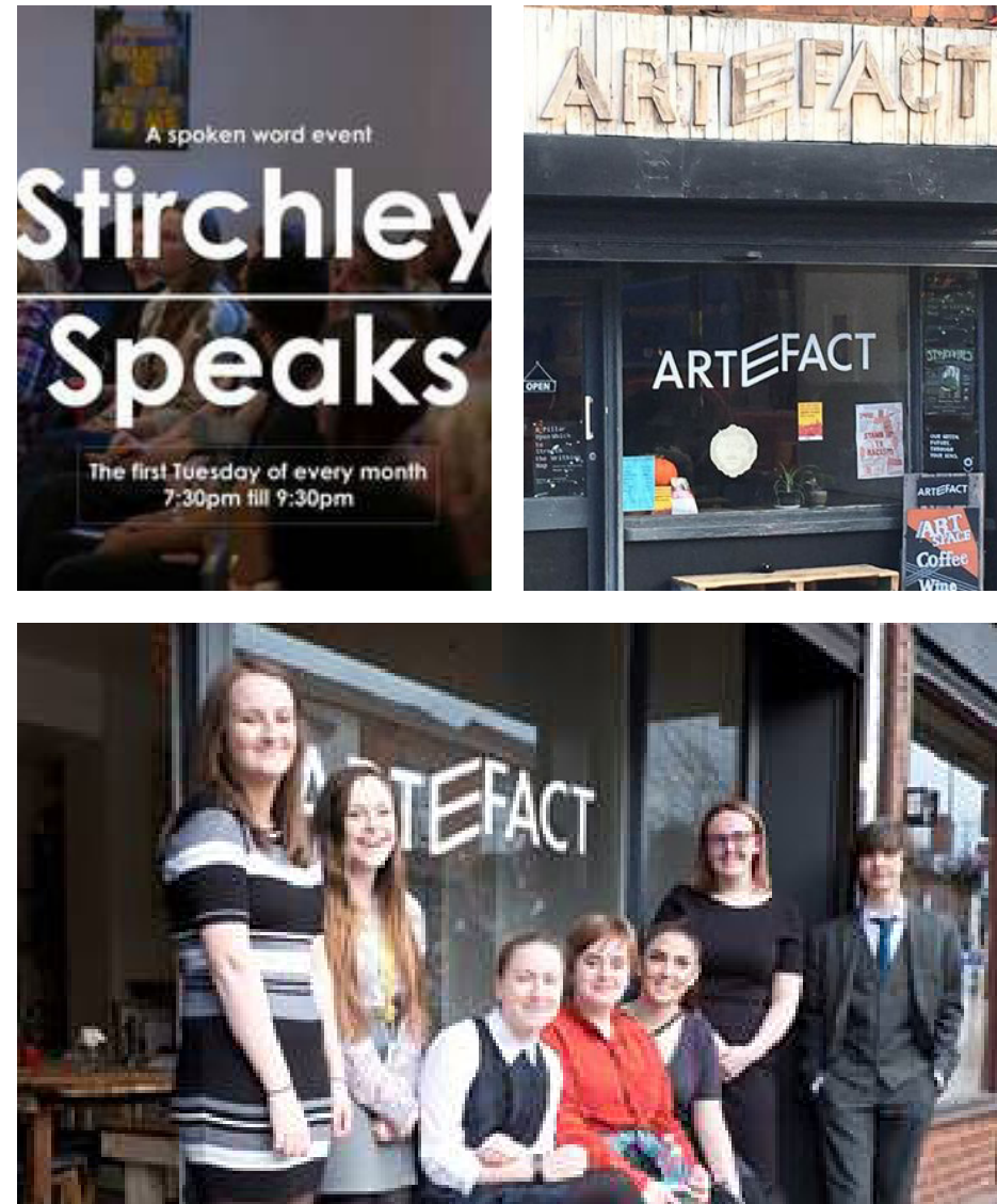
Fig 1 - Existing Artefact Shop on Peshore Road

Artefact serves as a conduit to Birmingham's broad cultural offerings. Stirchley is a deprived area within Birmingham with reduced or at-capacity transport links to other areas of the city. Artefact forms partnerships with galleries, festivals and other cultural organisations in Birmingham ensuring the local community has access to a breadth of artistic experiences.