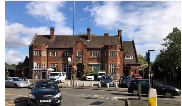
Fig 7 - View 1: existing listed British Oak Public House