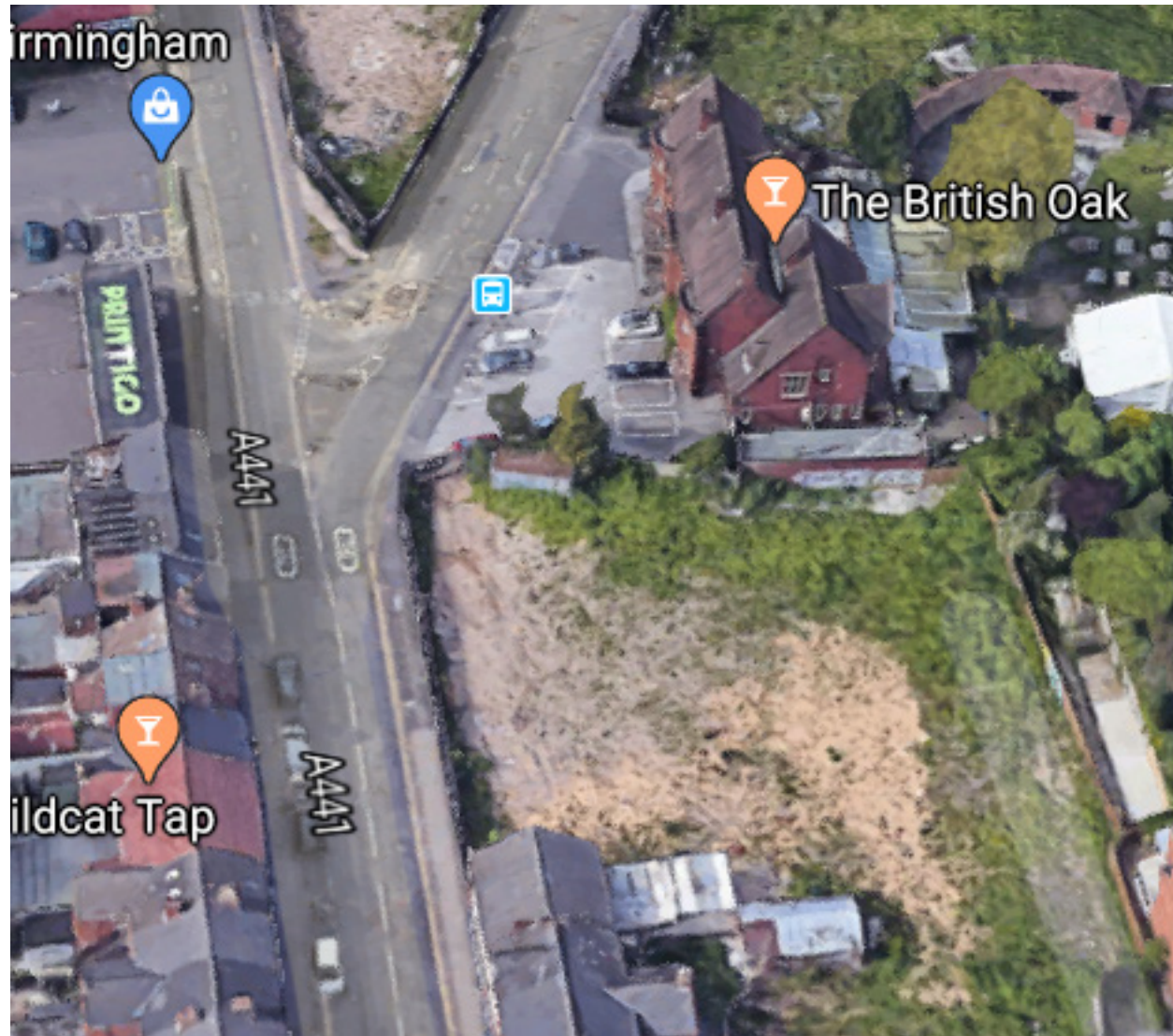
Fig 5 - Existing site features on Pershore Road

Opportunities for biodiversity enhancement will be explored in a soft landscaping scheme to be prepared by others.