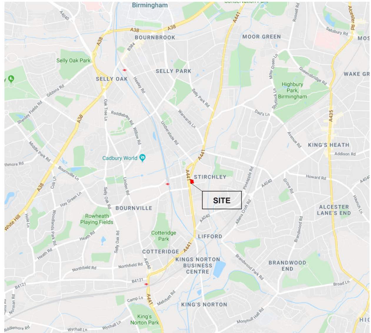
Fig 4 - Site Location Map

The immediate context of the land is primarily residential and retail. Pershore Road is effectively a high street of retail and commercial enterprise, whilst Hunts Road contains dwellings of likely Victorian origins. For the past few decades, this area of the city has suffered decline in commercial enterprise. Alongside this, the residential form is in need of regeneration. Today, large tracts of land remain undeveloped