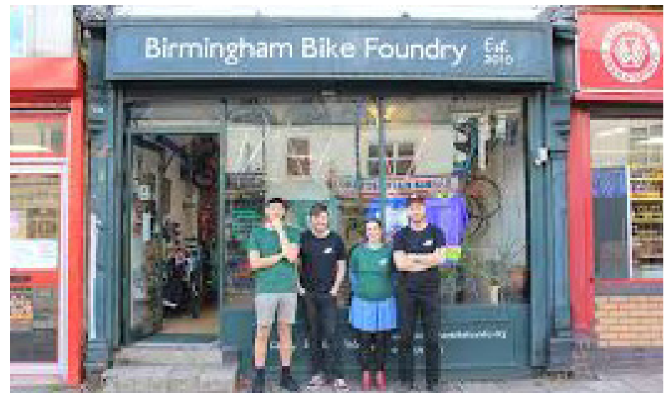
Fig 2 - Existing Birmingham Bike Foundry Shop on Pershore Road