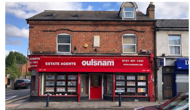
Fig 8 - View 2: typical adjoining building on Pershore Road